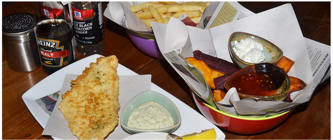
Snapper - Fish & Chips