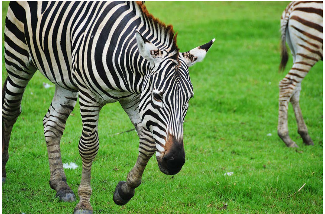
Safari World - Zebra in the Safari

their colors, and what they were doing. The most exciting part of the safari drive was driving through the lion and tiger portion of the park. This was where Safari World advises you “If your car breaks down, please do not get out. We will come to you!” There are also signs every few feet in many different languages warning guests to keep your doors closed and windows rolled up. If you are lucky enough, you might be able to time your driving tour with the big cat’s feeding time; this is when a caged vehicle drives through the habitat throwing out fresh meat.