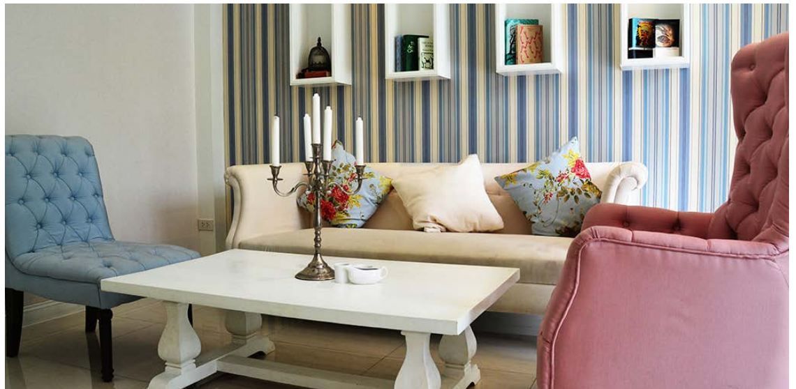
Elysian Tea House - The Breton Room