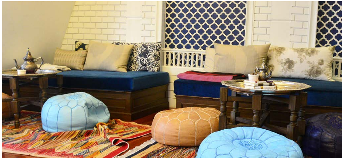
Elysian Tea House - Dar al Rumi room

Elysian Tea House is open Tuesday through Sunday 9am until 8pm. You can find them on Facebook ( https://www.facebook.com/ElysianTea ) or for more information you can go to their website ( http://teahouse.elysian-tea.com/ ).