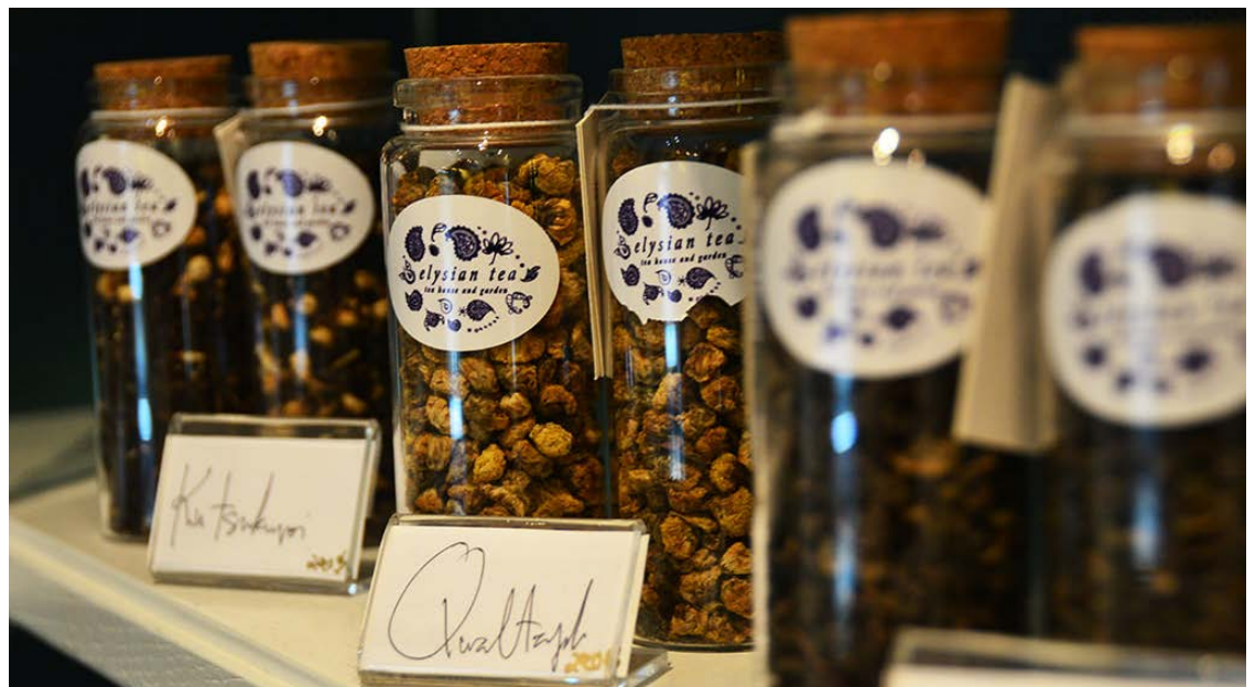
Elysian Tea House - Jars of loose leaf tea

I would suggest you come hungry. Chef Jonathan has created many tasty desserts which includes a lemon tart on top of a rich butter cookie, macaroons, and several other pastries you can choose from. If you are in the mood to try more than one sweet be sure to order the tea and dessert set. There are three different options; two of the sets come with different cookies, a creamy treat topped with berries and sweet moose, or the other set you can have four different macaroons; all very affordable ranging from 200-250 baht and this includes a pot of tea.